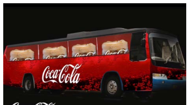
Bus for Coca Cola

In the meantime we are working on a new great project in Pakistan and developing a new Media advertisement bus as mentioned on the right for Coca Cola. This bus will be driving day and night and be placed on shows and events in Pakistan.